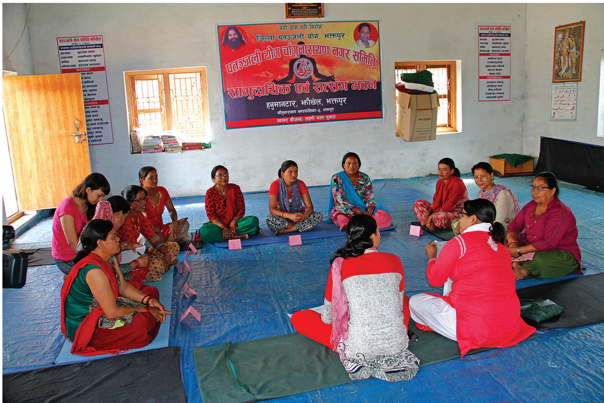
Focus Group Discussion with Key Influencers' - Bhaktapur

form a sophisticated web that entraps, rather than liberates, adolescent girls.